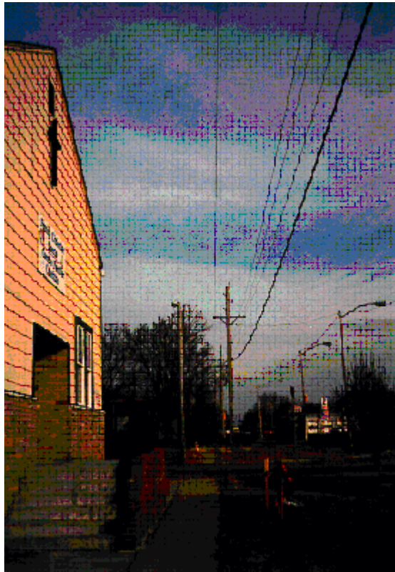
Figure 1. Incident Scene where ladder contacted overhead power line.